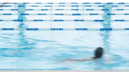
Selected references Sportcentrum Fitness First (the Hague), Czàsar Swimming Pool (Budapest), Sports & Aquatic Centre (Melbourne). Reference list available on request.